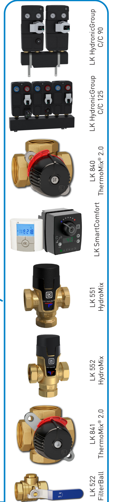
LK HydronicGroup C/C 90