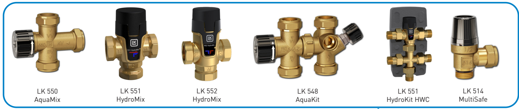
LK 550 AquaMix