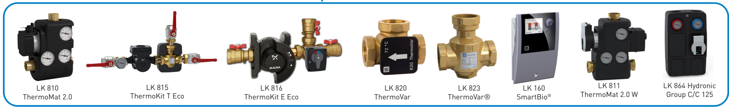
LK 810 ThermoMat 2.0