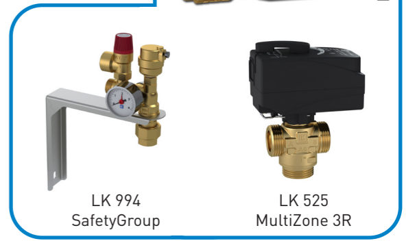
LK 994 SafetyGroup